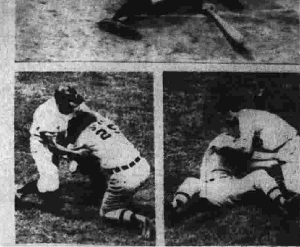
START OF SOMETHING BIG—Ducked by inside pitch from Tommy John of Chicago, Dick McAuliffe of Detroit walked but on way to first, he was mounded and threw a shoulder block at the pitcher. The pair then tangled before being ejected. John suffered injury to shoulder.

End of the Line Total of 178 boys have registered for midweek football this fall. The boys will be divided into three divisions: A, B, and C. The A division will play on Wednesday night at the West Hills Oval. The B division will play on Wednesday night at the West Hills Oval. The C division will play on Wednesday night at the West Hills Oval.