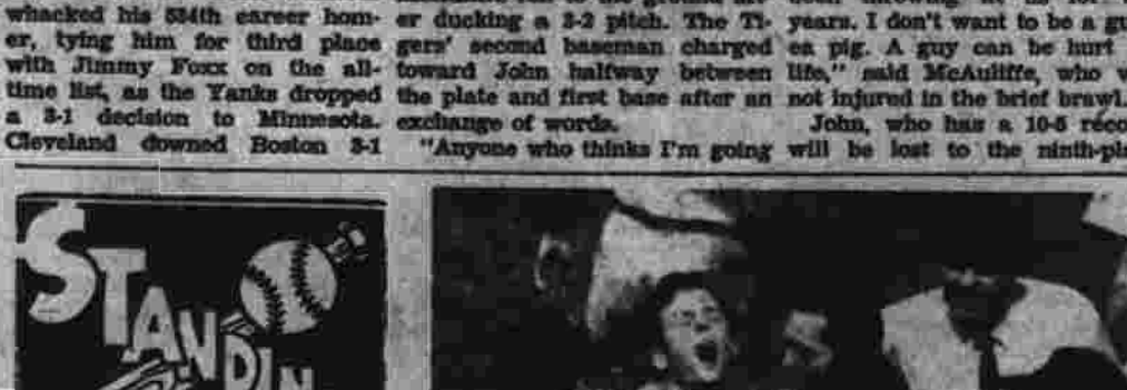
START OF SOMETHING BIG—Ducked by inside pitch from Tommy John of Chicago, Dick McAuliffe of Detroit walked but on way to first, he was mounded and threw a shoulder block at the pitcher. The pair then tangled before being ejected. John suffered injury to shoulder.

NEW YORK (AP)—Two homers in one game, powerful fielding and a lead-off home run would have made it a sure thing that Allen would be the MVP of the year. But he is behaving like a man who is unhappy with his present lot. For the fifth time this season, the safety outfielder slammed the door behind him. Allen, who has been charged with leading the team, said he thought the "best thing for me to do is to get out of town." Allen, who has been charged with leading the team, said he thought the "best thing for me to do is to get out of town."